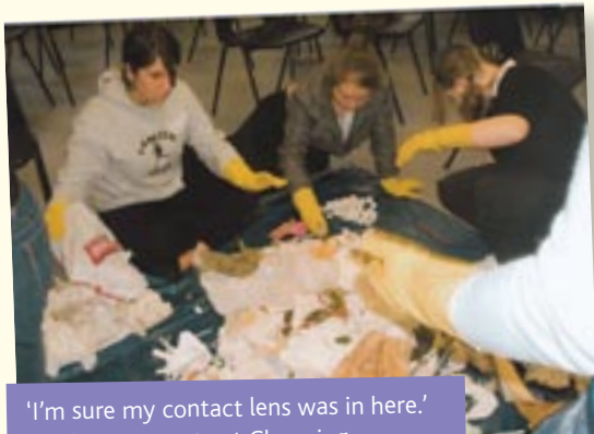
'I'm sure my contact lens was in here.' Sorting out waste at Channing