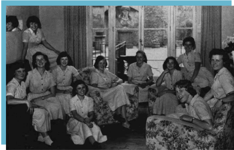
PREFECTS' COMMON ROOM 1958

A blast from the past... This space is now the Medical Room and the Sixth Formers have their very own building!